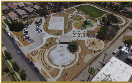
Rancho Cucamonga facility