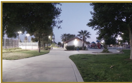
Playground and other facilities