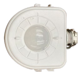
M8 Sensor Continuous dimming with daylight harvest