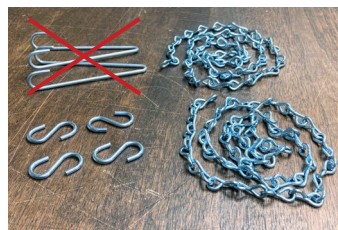
Chain Kit Shown (standard)