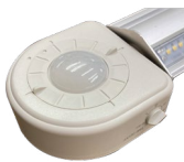
M1 Sensor on/off