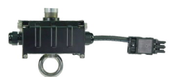
ETG-BKT-CHB-PD2 Pendant Mount (320W & 480W) 3/4" NPT