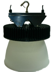
ETG-HBRH-RAC (320W&480W) High bay reflector, acrylic