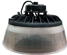
ETG-HBRH4S-RAC (120W) Small Acrylic reflector ETG-HBRH4L-RAC (150W & 200W) Large Acrylic reflector