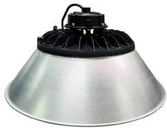
ETG-HBRH4S-RAL (120W) Small Aluminum reflector ETG-HBRH4L-RAL (150W & 200W) Large Aluminum reflector