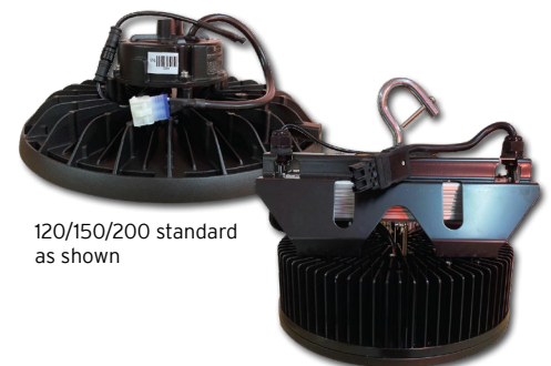
120/150/200 standard as shown