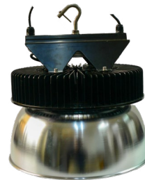
ETG-HBRH-RAL (320W&480W) High bay reflector, aluminum