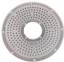
ETG-LEN-CHS4-60S Additional Lens Option (120W)