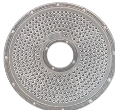
ETG-LEN-CHS4-60L Additional Lens Option (150W & 200W)