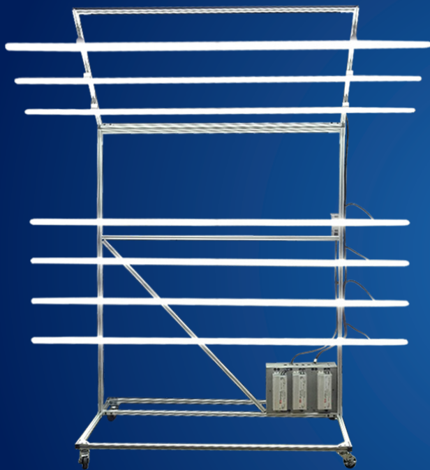
Single-Sided, Horizontal Orientation