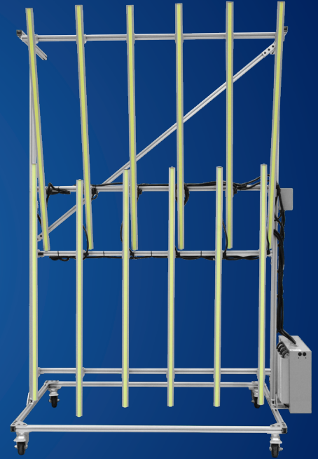
Single-Sided, Vertical Orientation