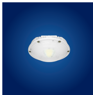
Low Bay Canopy & Parking Up to 7,800 lumens, integrated light and motion sensor