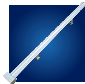
Mantis Task Light 4' linear configurations, task or low bay applications