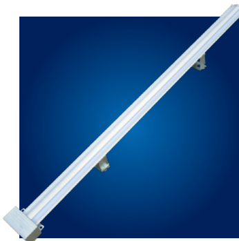
Mantis Task Light 4' linear configurations, task or low bay applications

We have several complete lines of products for both indoor, outdoor, and specialty applications (such as grow, inspection, hazardous) to exceed your organization's energy savings goals, fast-track your ROI, and enhance your overall light output. Explore the versatile products below more on our website at www.HornerLighting.com to quickstart your savings today.