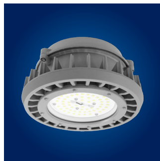
Hazardous Location Class 1 Div I or Class 1 Div II high or low bay applications