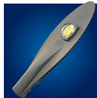
Enterprise Series Up to 39,000 lumens, diverse lens type options